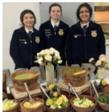
Los Molinos Chamber of Commerce thanks the Los Molinos High School's Future Farmers of America for serving at this year's dinner.