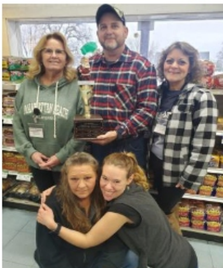
The crew at NuWay Market poses with the coveted Santa Trophy they won after taking first place during the Los Molinos Light Fight.